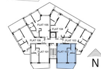
1 bedroom flat 52.50m 2 FLAT 102 / 202